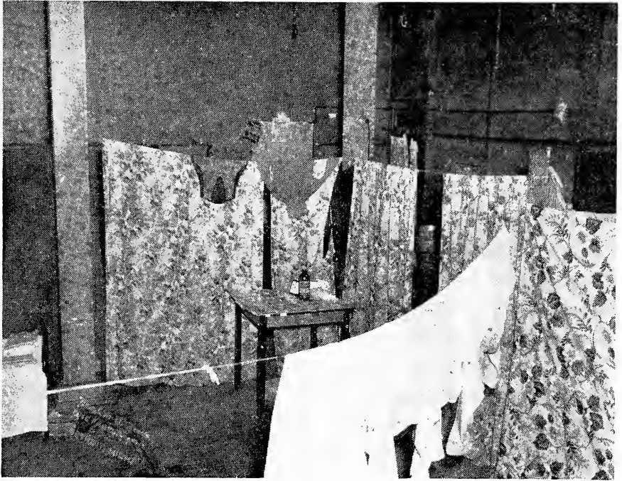
Curtains and clothing are hung to form room partitions for a family of four.